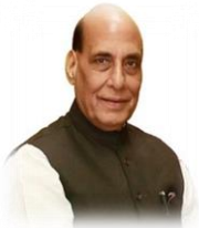
Shri Rajnath Singh