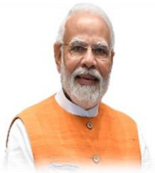
Shri Narendra Modi