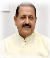
Shri Jitendra Singh

Minister of state for Science and Technology, India